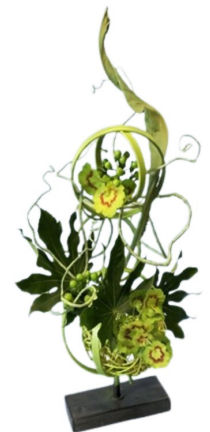
Fatsia, Pelargonium, dried & painted Strelitzia — Barbara Weiler Design

I have hundreds of design pictures categorized by type on Pinterest including a board titled Leaf Manipulation. Log onto Pinterest and search for Barbara Weiler to view them. Experiment with the plants in your garden and see what you can create!